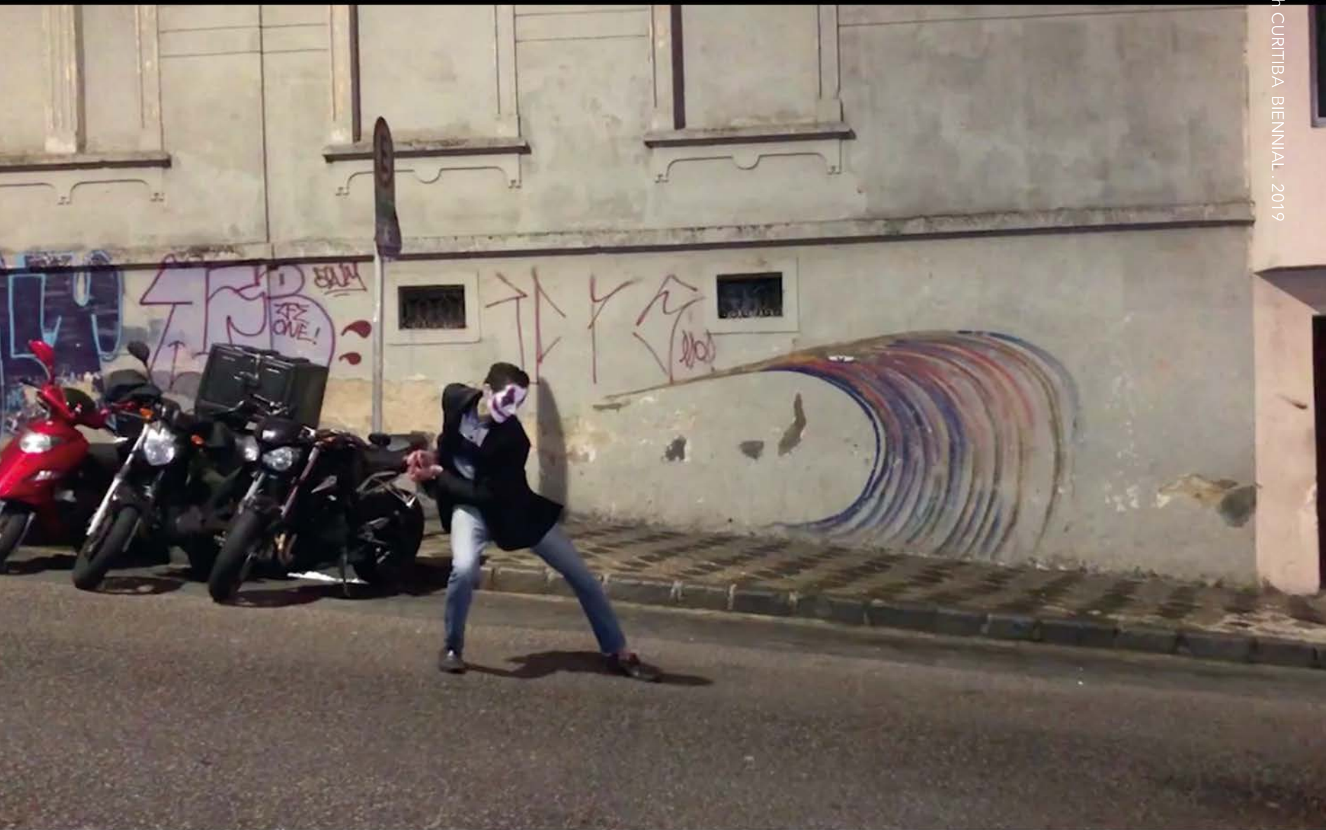
NÓS SOMOS AQUECIMENTO GLOBAL (Gato Preto), 14th CURITIBA BIENNIAL HD Video, 69 sec. looped