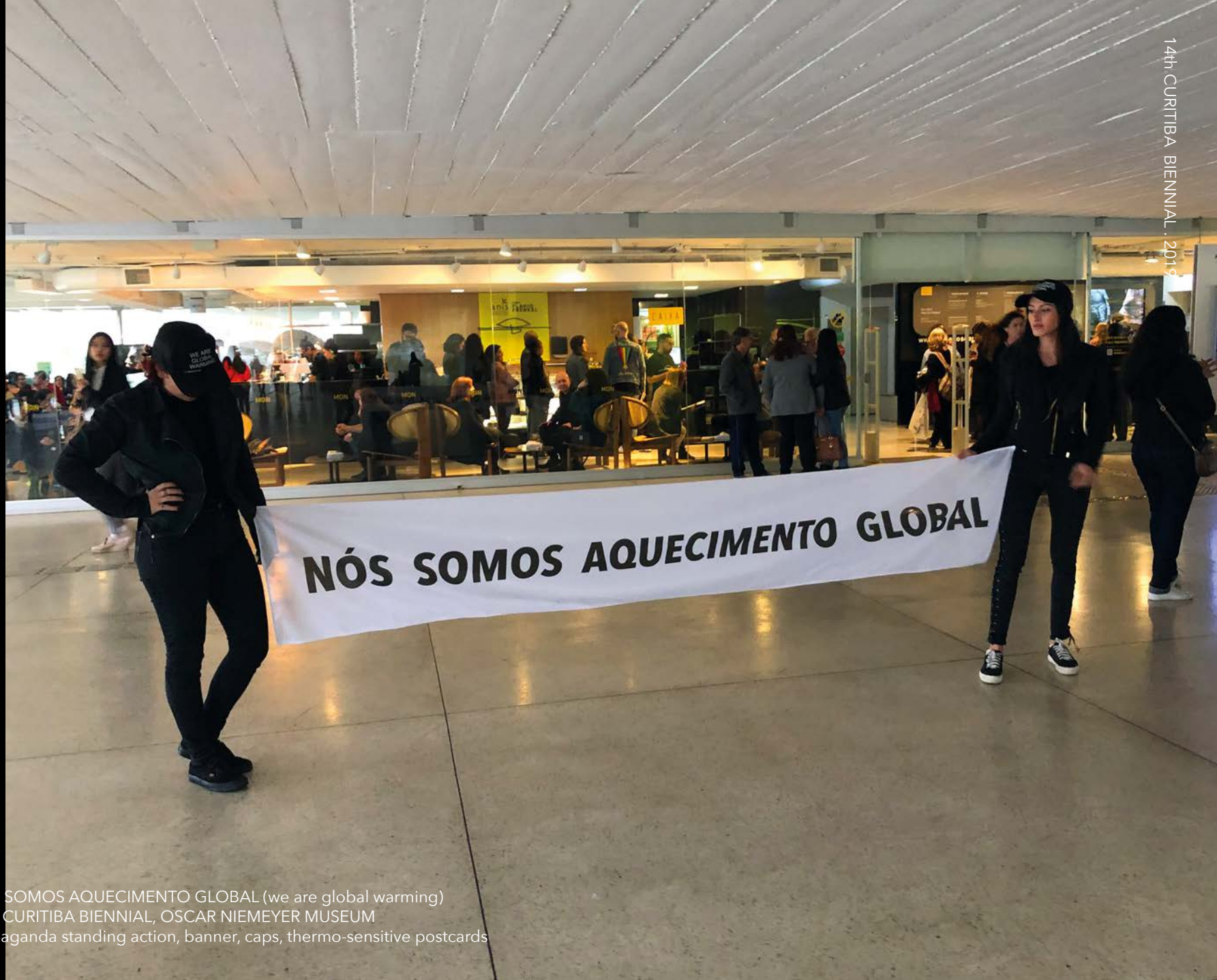
NÓS SOMOS AQUECIMENTO GLOBAL (we are global warming) 14th CURITIBA BIENNIAL, OSCAR NIEMEYER MUSEUM propaganda standing action, banner, caps, thermo-sensitive postcards