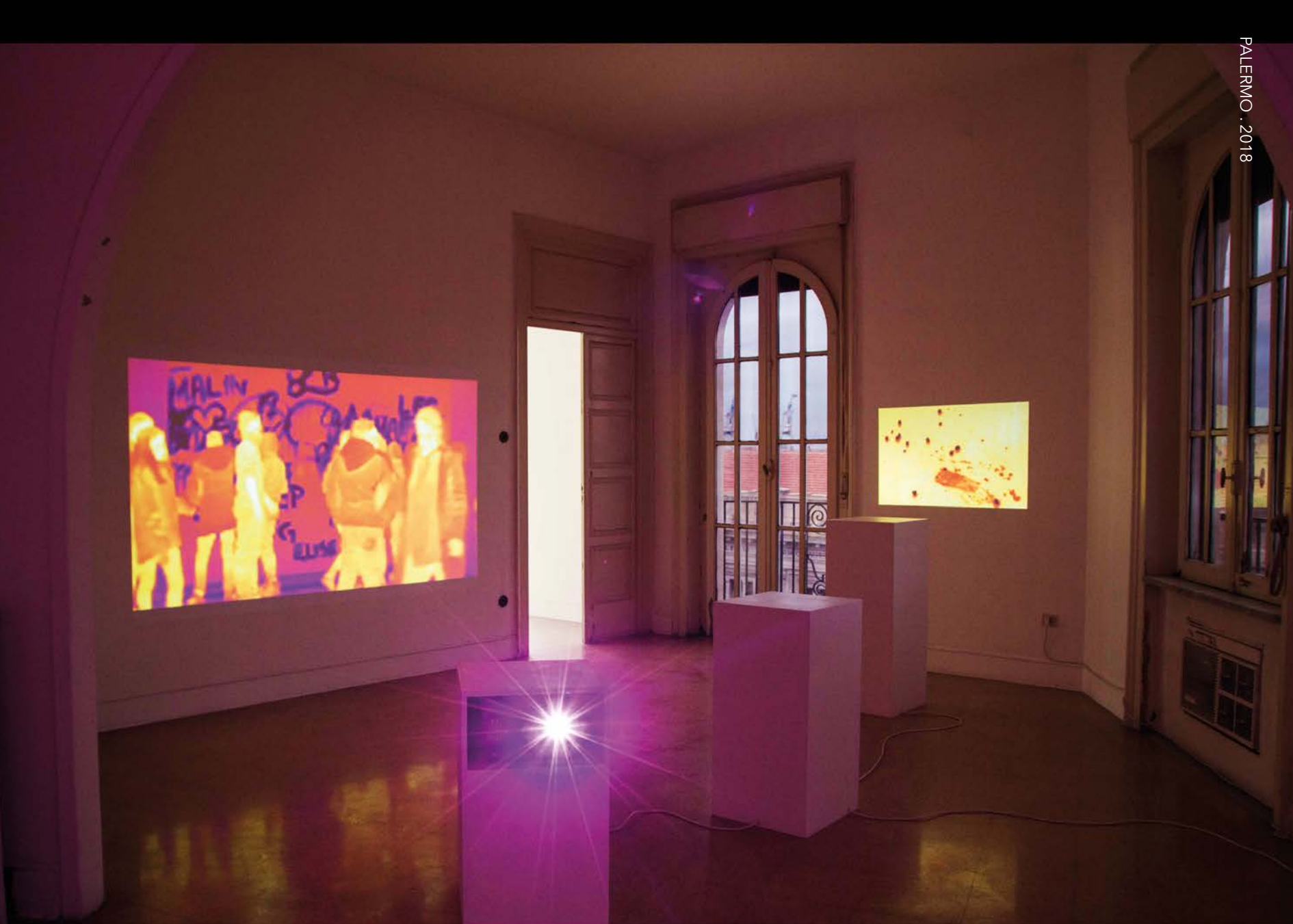
TBOE, CASSATA DRONE, infrared video installation, light control window film