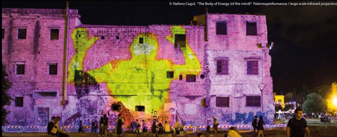
© Stefano Cagol, "The Body of Energy (of the mind)" Palermopreformance / large scale infrared projection

Sie sind hier: Startseite » Stefano Cagol: „Wärme ist ein Symbol für Leben“