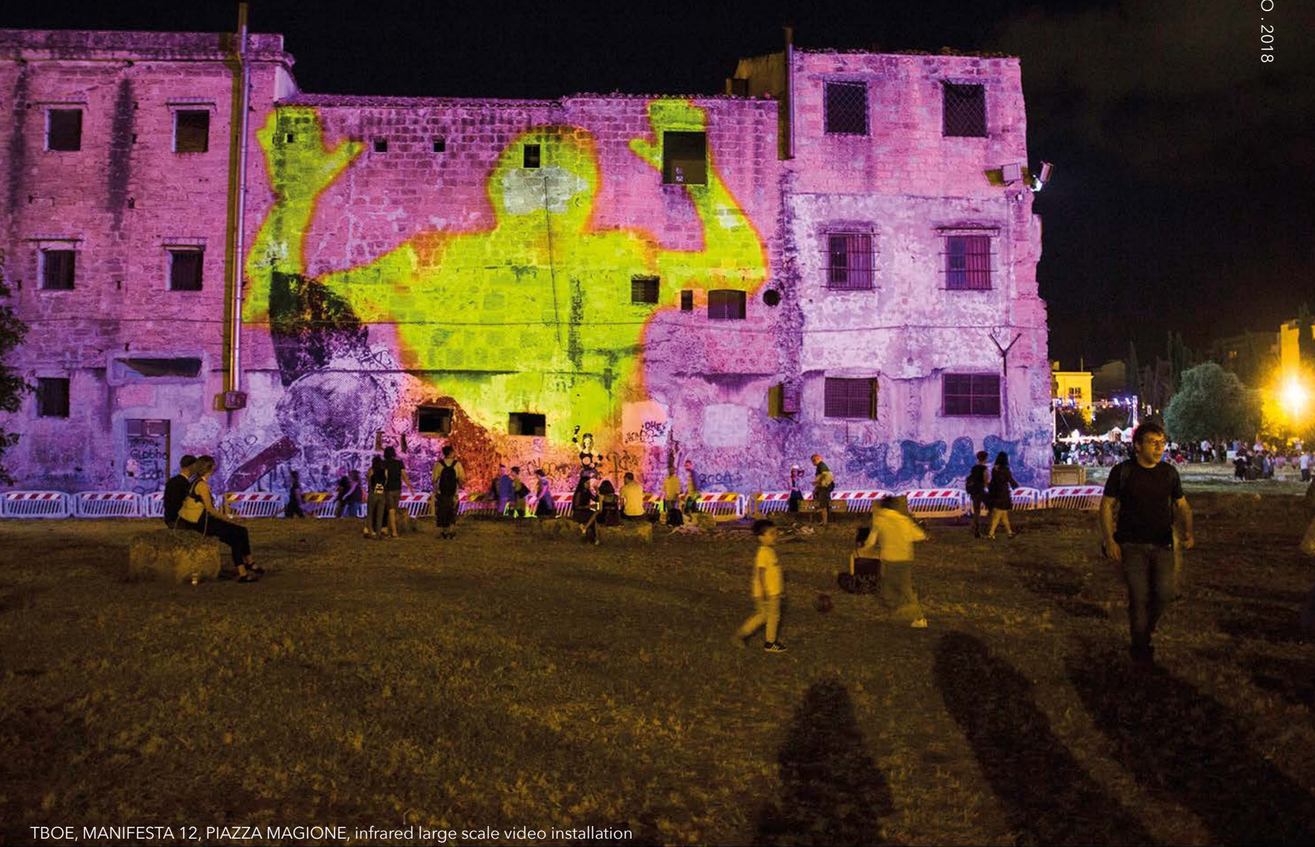
TBOE, MANIFESTA 12, PIAZZA MAGIONE, infrared large scale video installation