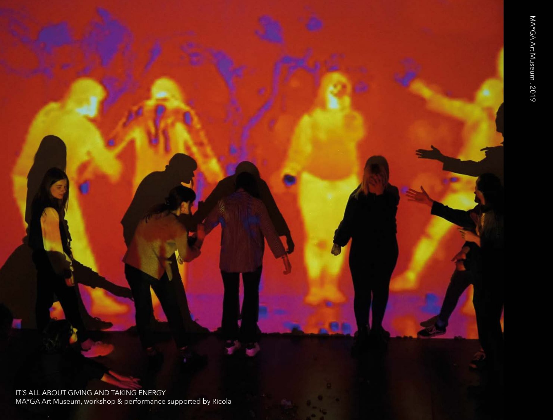
IT'S ALL ABOUT GIVING AND TAKING ENERGY MA*GA Art Museum, workshop & performance supported by Ricola