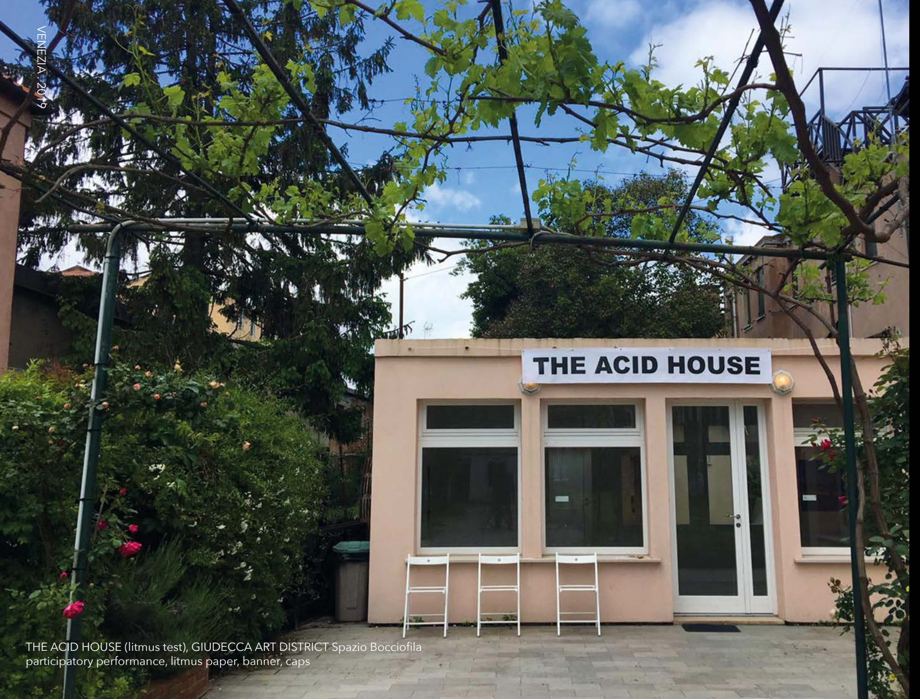
THE ACID HOUSE (litmus test), GIUDECCA ART DISTRICT Spazio Bocciofila participatory performance, litmus paper, banner, caps