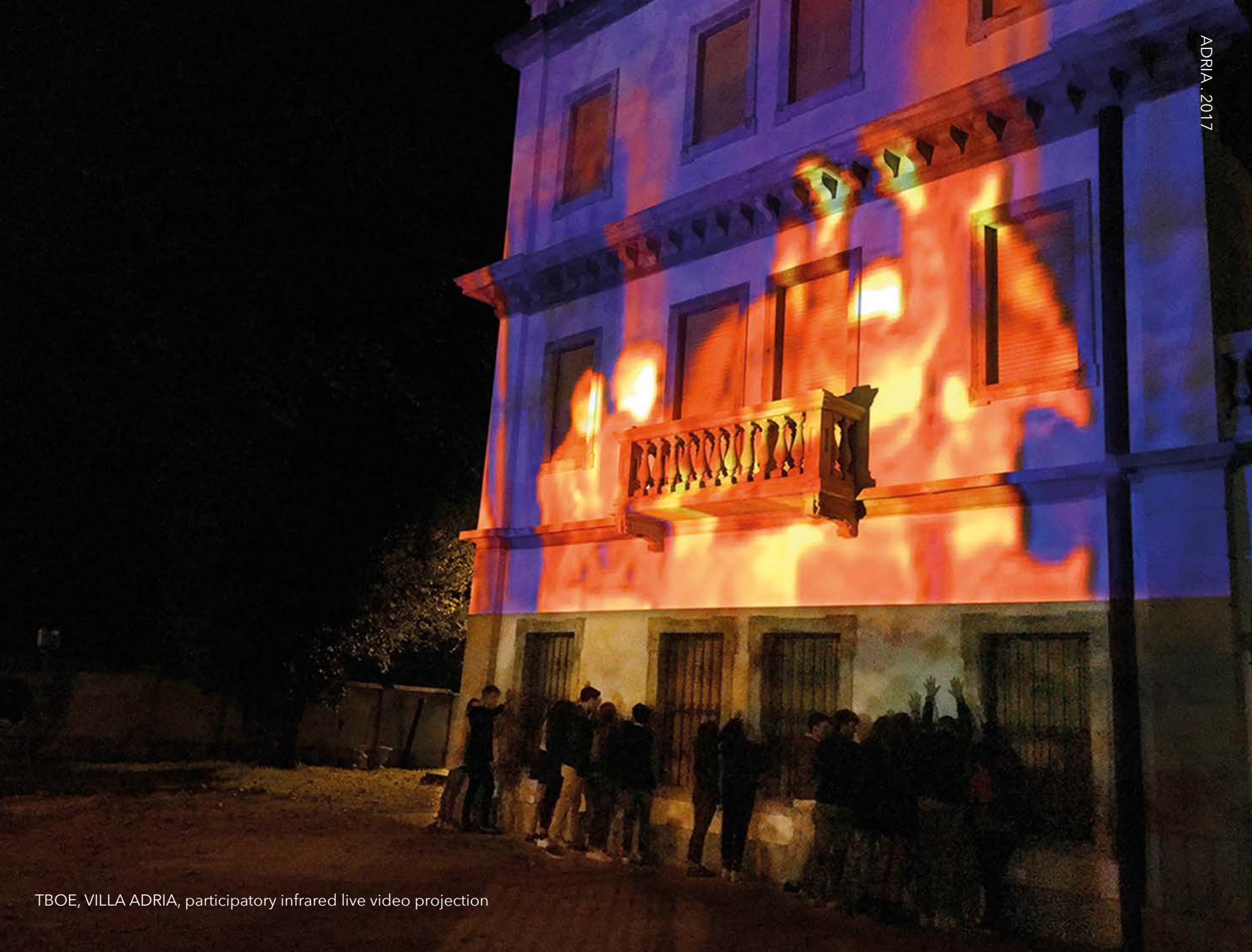
TBOE, VILLA ADRIA, participatory infrared live video projection