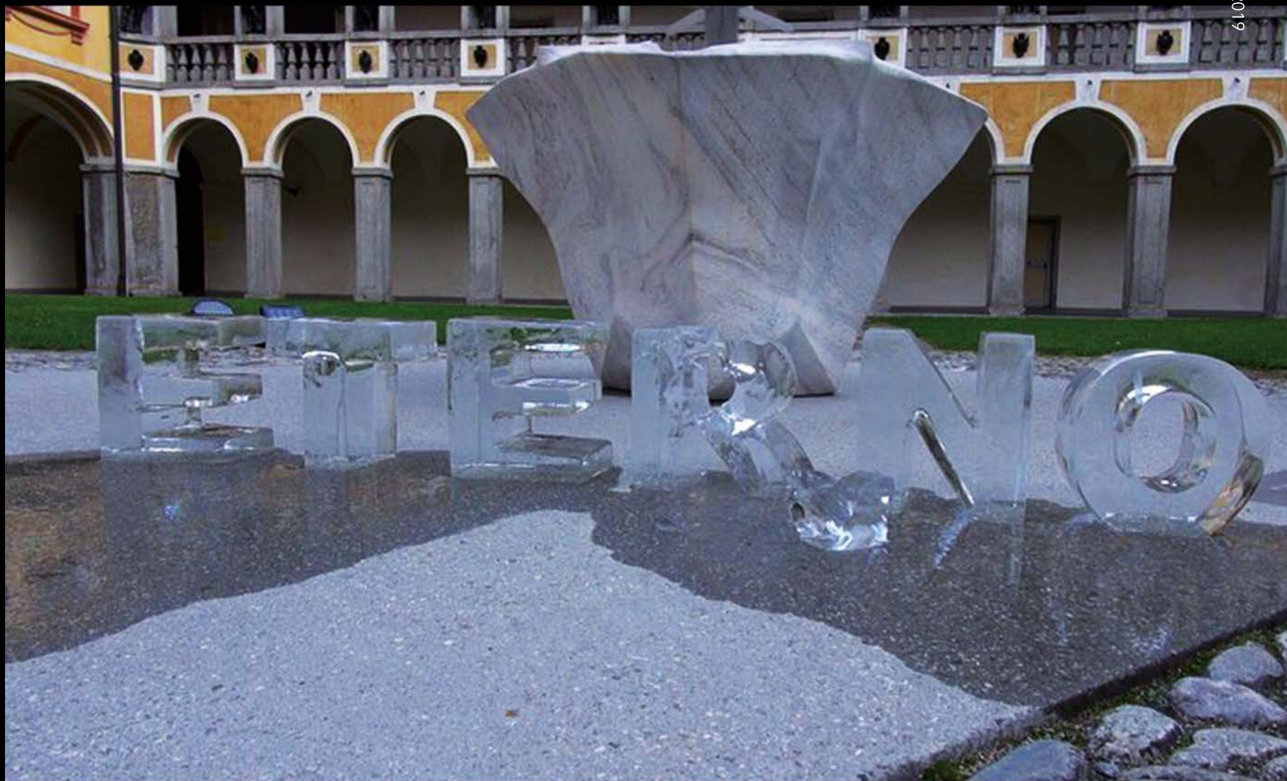
ETERNO, FESTIVAL DELL'ACQUA, HOFBURG performance, ice, aerosol spray, fire, hammer, video