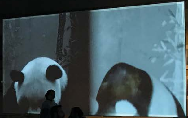
EVOKE PROVOKE (THE BORDER), THE MINISTRY OF ENVIRONMENT video installation